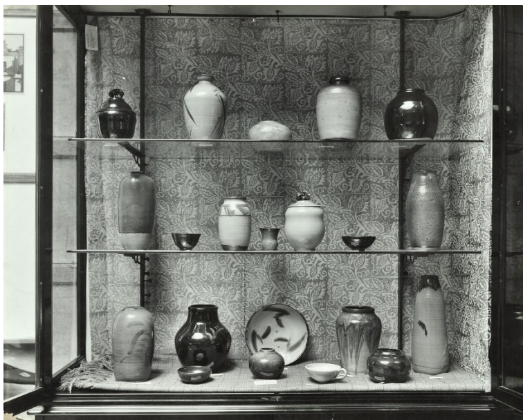
Fig. 11. An exhibit of student work at the Central School of Arts and Crafts, 1931, made in stoneware with reduced glazes.