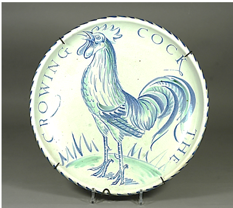
Fig. 4. 'The Crowing Cock', a tin-glazed plate by Dora Billington. Diameter 37cm. (Private collection.)

An inscribed tin-glazed dish of uncertain date, ‘The Crowing Cock’, illustrates Billington's debt to Johnston. ( Fig. 4 ) The lively drawing in blue and green is accompanied by refined Roman capitals around the rim. There is confidence in the brush work, the inscription and the design, which refers to Delft ware without directly copying it. There is little comparable calligraphy on her pottery, but her lettering on this piece is so good that it is surprising that she did not do more of it, and it could be argued that she was more talented as a decorator than a maker.